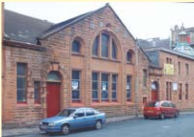
Sharpe Memorial Church