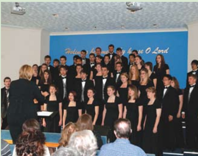
The Moody Chorale presenting a programme at the Irvine Church of the Nazarene .