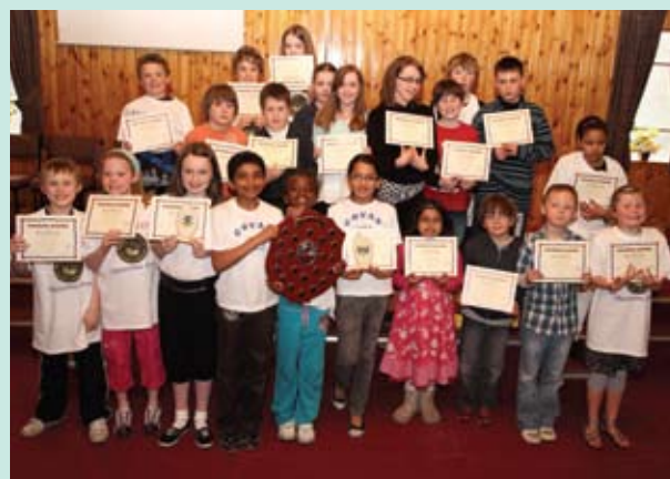
Quiz Teams at Govan