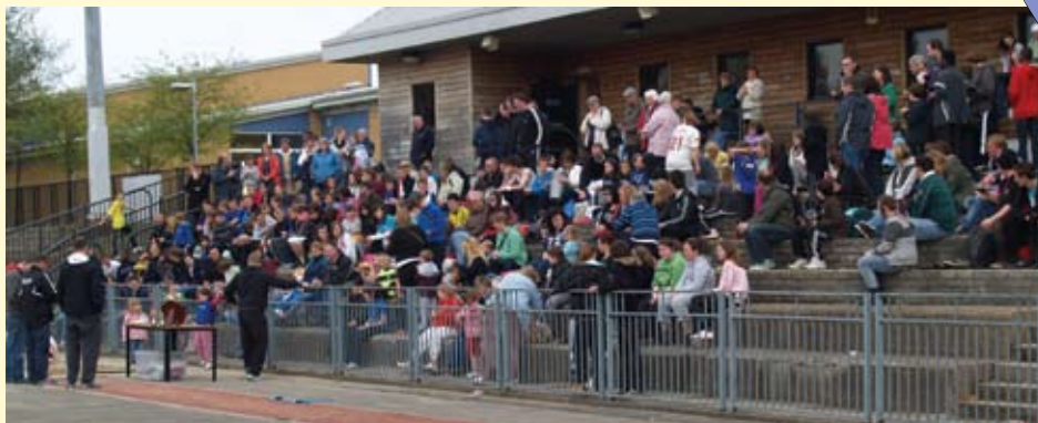
Medal Giving Ceremony - part of the Sports Day Crowd...the medal giving ceremony was held, this year, at the Sports Ground.

It was good weather for the 2010 (North) District Sports Day, held Saturday, 1st May in Glasgow . Many churches from across Scotland and from the N. England were represented. Congratulations to the winning teams: 1st Irvine, 2nd Parkhead, 3rd Perth .