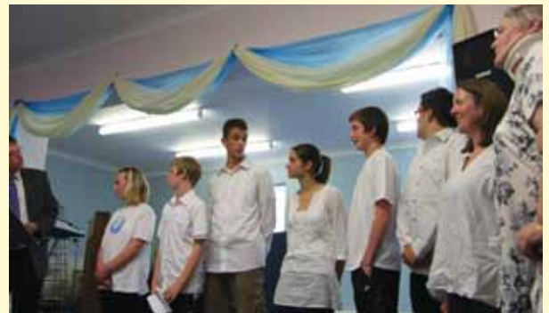
Sheffield baptism candidates.

“Anyone who belongs to Christ is a new person. The past is forgotten, and everything is new. God has done it all!” (2 Cor. 5:17-18).