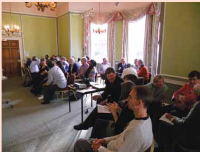
Discussion and sharing at the South pastor's fraternal.

Both conferences were characterised by times of prayer, inspiration and challenge.