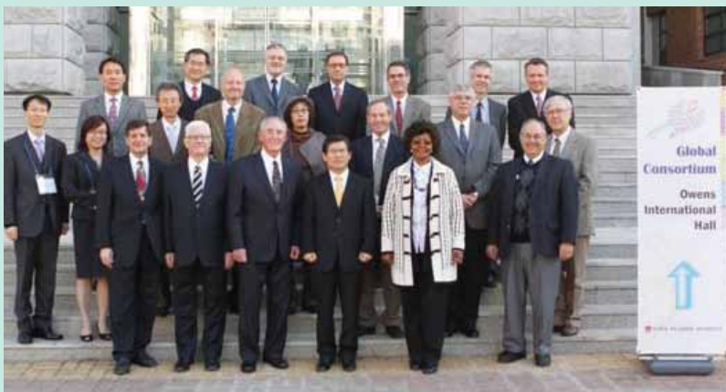
Global Consortium group at Korea Nazarene University .