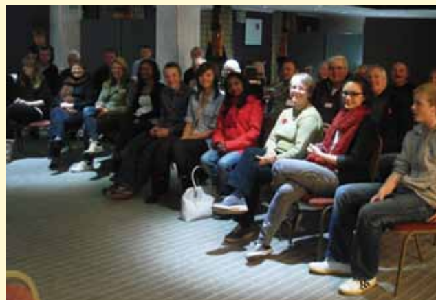
JUST 10 group at the River Inn, Hotel, Houston.