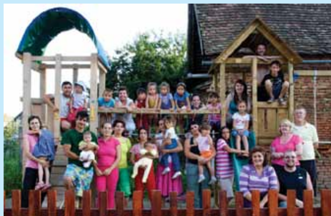
The team with families from Tigmandru at the family Camp in Laslea .