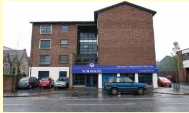
NCM House, 218 York Street, Belfast, with new signage

The Building has been renamed NCM HOUSE , and will be the base for NCM operations and activities. The committee is hoping to appoint a coordinator of Compassionate Ministries to initiate a new ministry to the North Belfast area and to help local congregations engage with their communities.