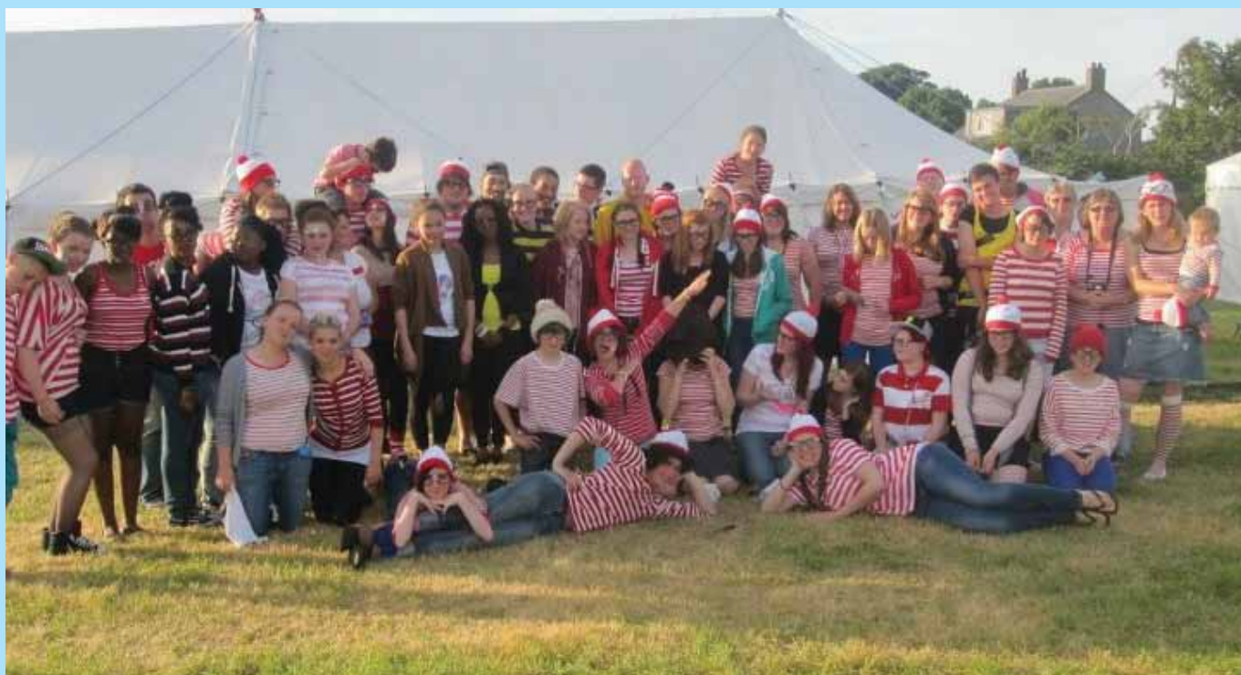
Youth Holiday Group at Nefyn