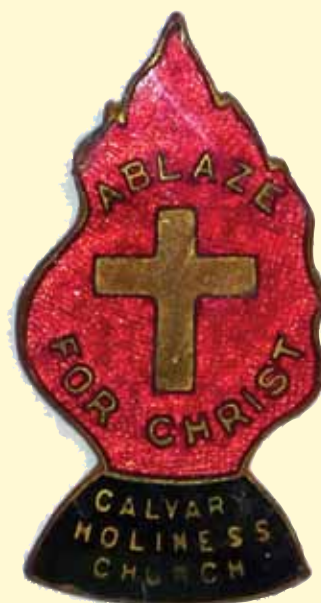
The "flame-emblem" of the Calvary Holiness Church