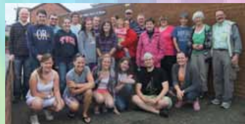
Team from Ontario, Oregon, with members of the Llay church

LLAY – over 30 children enjoyed an Olympic themed Messy Church at Llay Community church in June. A small team from Ontario Church of the Nazarene, Oregon, USA, visited the church as a Work & Witness group, working in the church and community (the team created a Prayer Room), and then they were joined by the others in their group (who had been working at Nazarene Theological College, Manchester), to assist in 'messy church'.