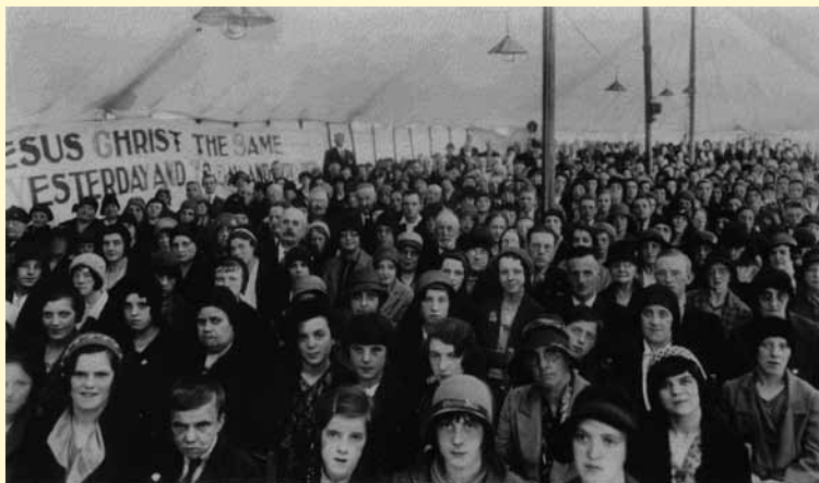
Inside the tent in 1932

Many changes have taken place across the years, and the community around the church is very different to what it was in the 1930s. But the message is unchanged, "Jesus Christ is the same yesterday, today and forever" - and the work goes on.