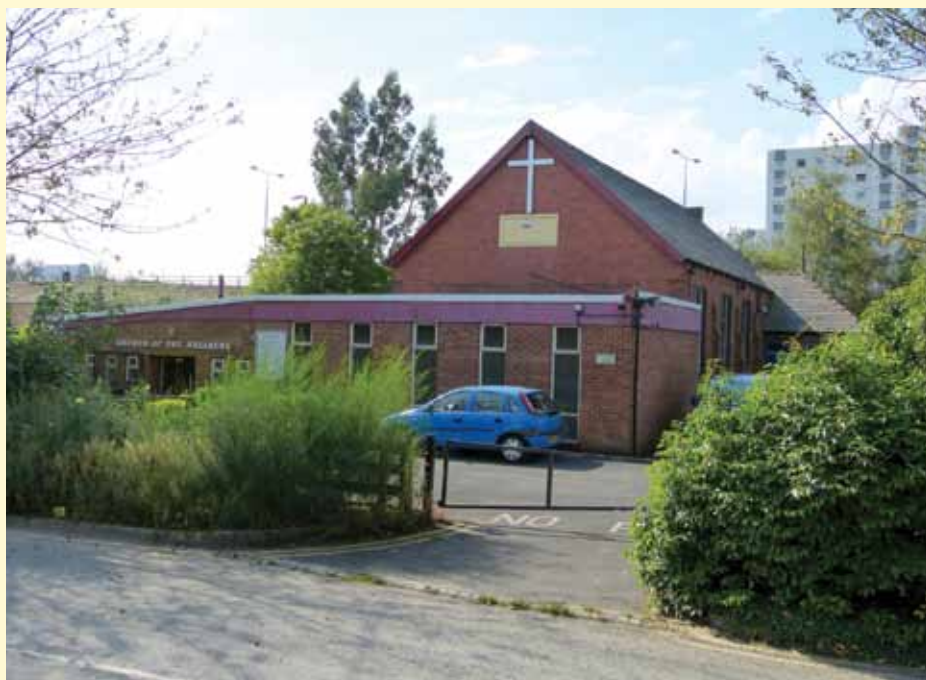
The building at York Street