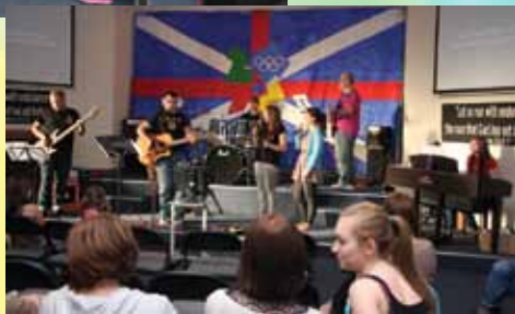
The Praise Band leads the evening worship