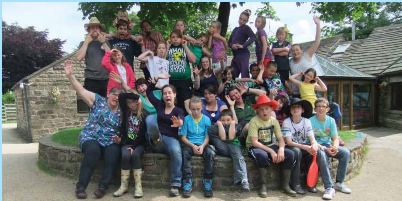
Campers in the 'brilliant' location in the Peak District

20 children and 10 adults from 5 churches (Llay, Ashton, London, Carlisle Raffles & Belle Vue) attended the South District Summer Camp, held, 7th-10th August in the Peak District (Hope Valley, Edale). The week was filled with outdoor activities with a 'cowboy-western' theme, but also, and more importantly, worshipping and learning more about Jesus.