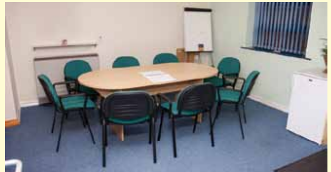
Part of the lounge/conference area that can be used for meetings