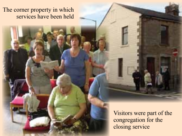
Visitors were part of the congregation for the closing service

The corner property in which services have been held