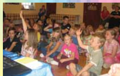
Boys & girls at the Dromore Holiday Bible Club