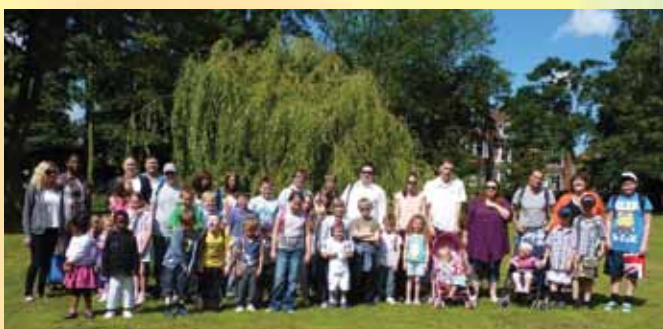
Trip to Filey on a beautiful day