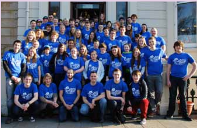
Young People at the Winter Retreat