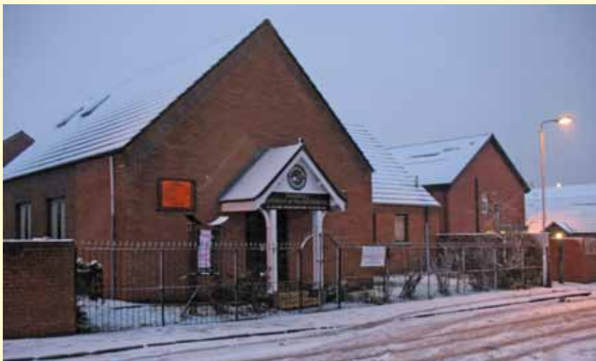
The Shankill Church on a snowy evening