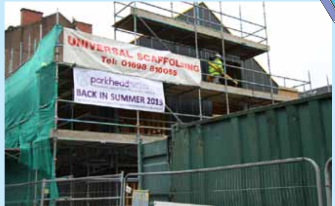
The "Back in Summer" 2013 banner on the scaffolding