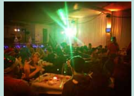
Youth Christmas Party - Dewsbury

Held in the Dewsbury Church, over 50 young people met for the South District Christmas Party on Saturday 15th December. Based on a "Pantomime Fancy Dress" theme the evening was marked by creativity, fun, games and good food. Thanks are expressed to the Dewsbury NYI for hosting a "fantastic party".