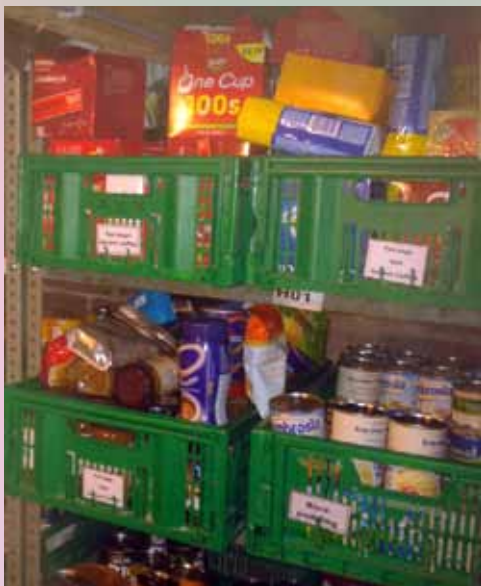
Sheffield Food Bank store - Food Bank store in the Heeley Methodist Church