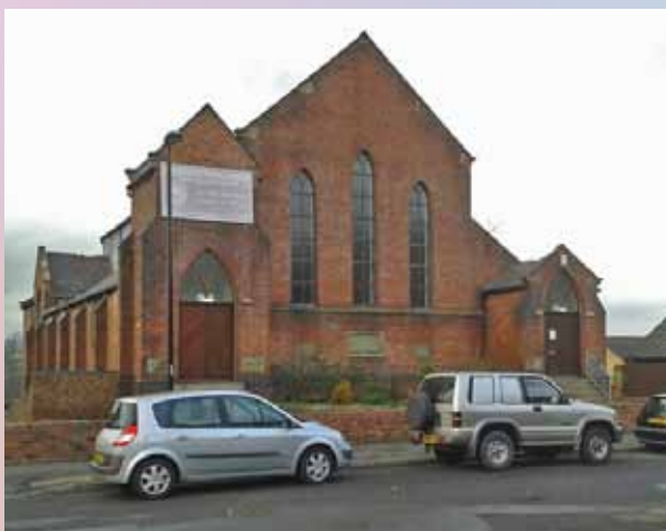
The Sheffield Heeley Church