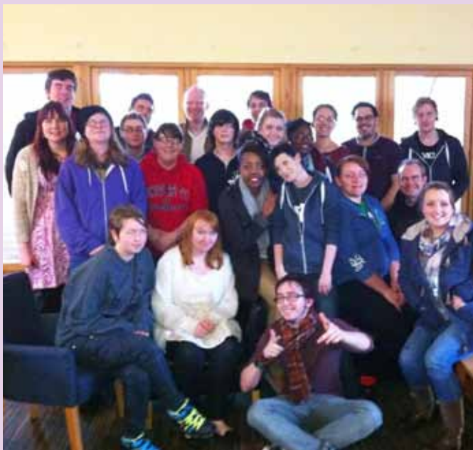
South District Leadership Retreat