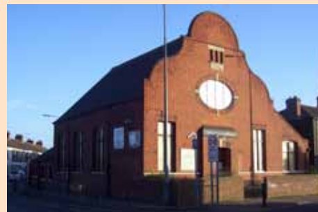
The Grimsby Trinity Church of the Nazarene at its corner location.