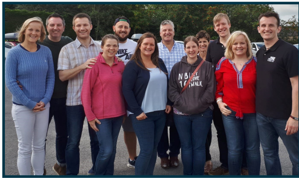
Northbreak Leadership Team