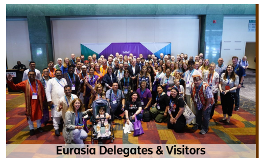
Eurasia Delegates & Visitors