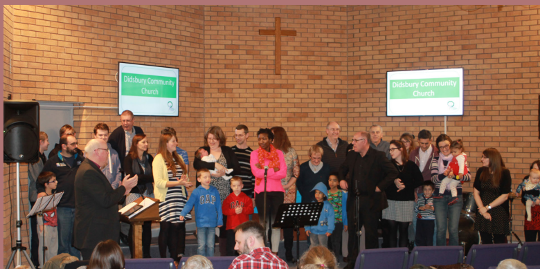
Members of Friends of the Didsbury Church - approx 40 in all - gather on platform