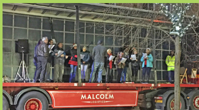
Members of the Houston church went carolling in Glasgow's Sauchiehall Street. An open-backed lorry was kindly provided by the haulage/logistics company, W H Malcolm Ltd

The events, activities and blessings of Christmas can be quickly forgotten as the church moves into the New Year, and the regular life and programmes of the church resume. Here are a couple of events to remind us of "Christmas Blessings".