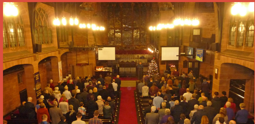
The crowd at Paisley St Matthew's