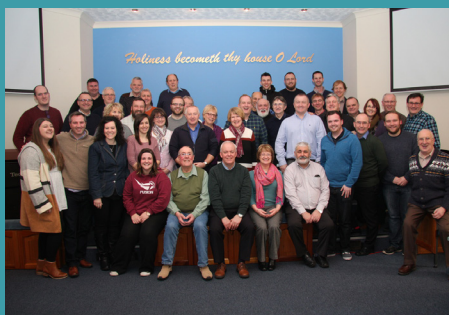
Prayer Conference - Irvine