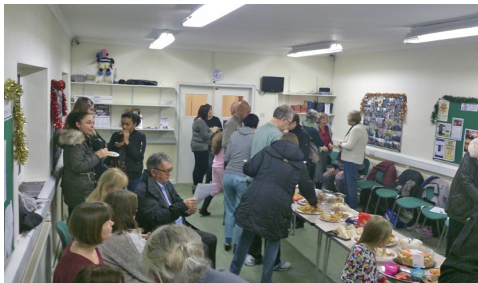
Winter Warmer Community Buffet