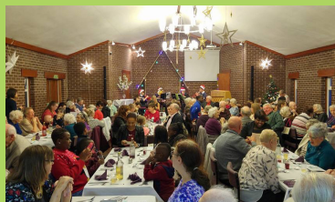
Members of the Brooklands, Manchester, church enjoy a Christmas Banquet