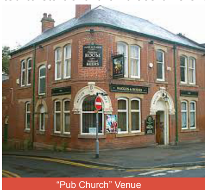
"Pub Church" Venue