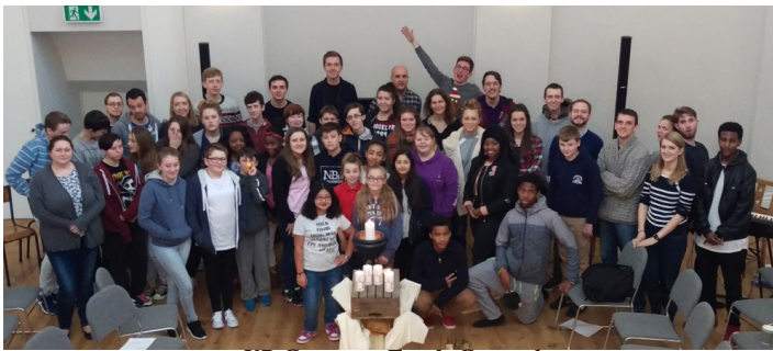
YP Group at Fresh Ground