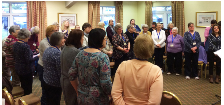
Ladies Retreat - Swanwick