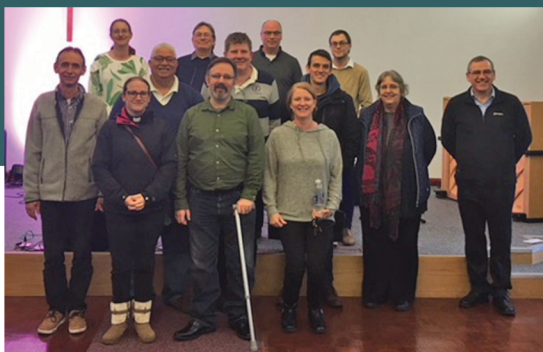
at Brooklands (Manchester)