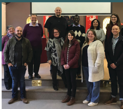
at Watford (Balmoral Road)