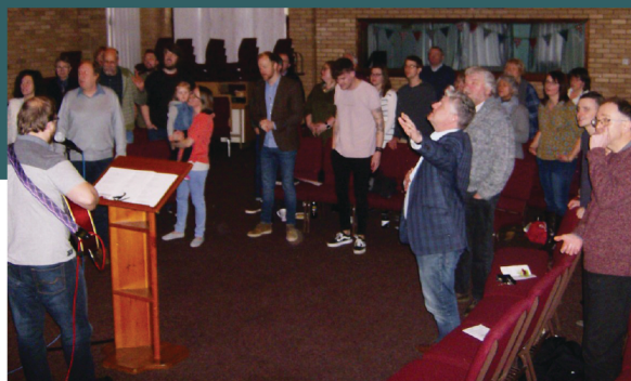
at Erskine/Bible Centre