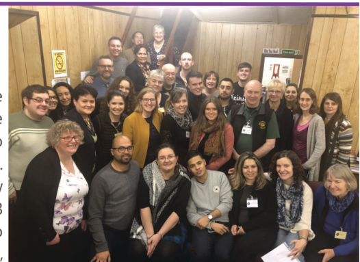
M+POWER participants at the Bible Centre

For more information visit http://eurasiaregion.org/volunteers/