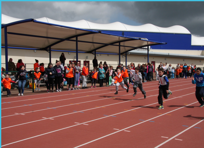
North District Sport's Day