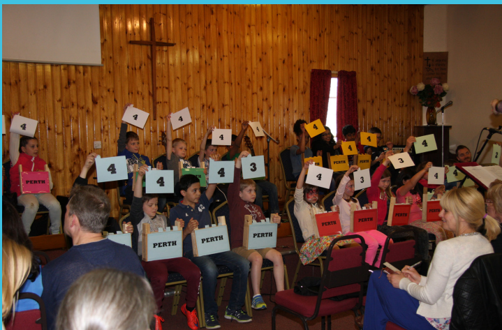
Children's Quizzing at Govan