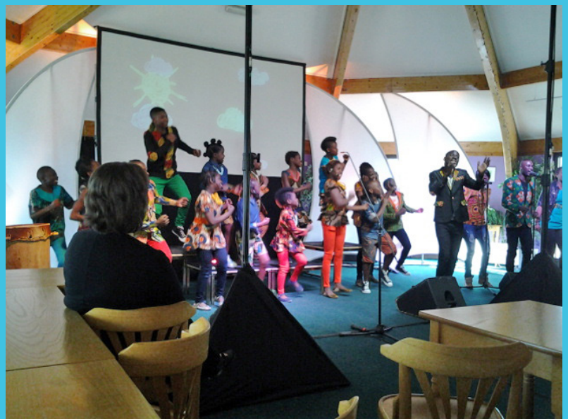
Watoto Choir at Strathclyde House