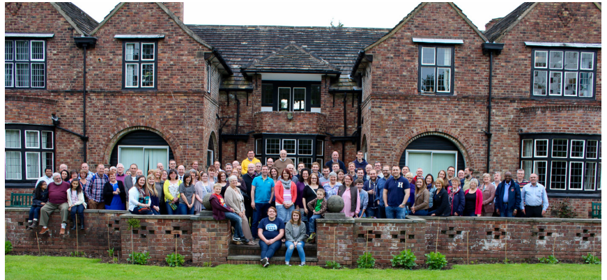
"Dare to Dream" participants at Nazarene Theological College, Manchester