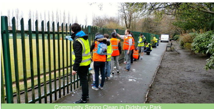
Community Spring Clean in Didsbury Park