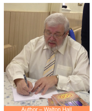
Author – Walton Hall