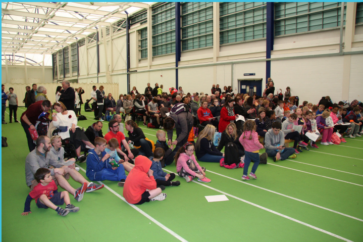
North District Sport's Day