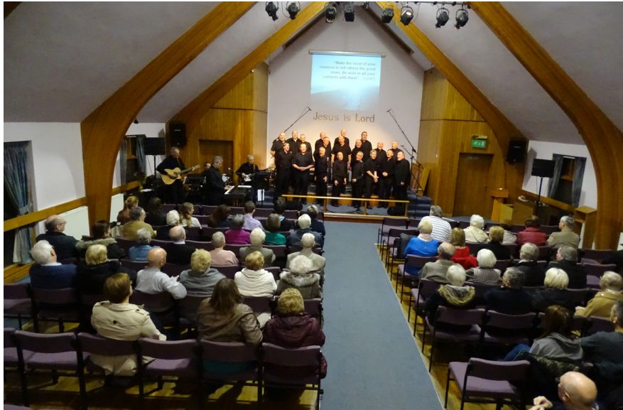
Port Glasgow Church with “Father’s Sing” group