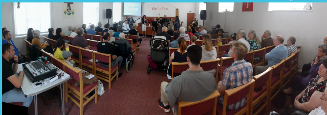
Barnsley anniversary congregation