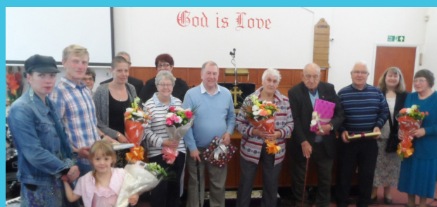
Board Members & Leaders receive flowers and gifts