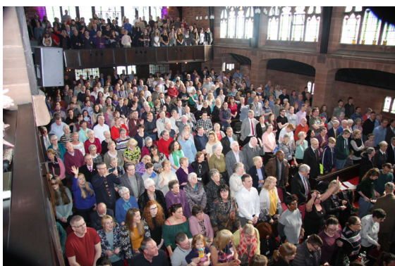
Ordination Service - a packed St Matthew's Church on Sunday morning 19th March