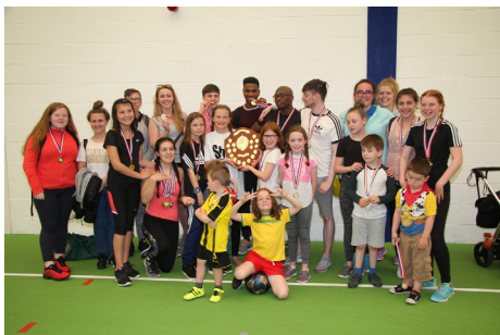
Winning Team - Parkhead