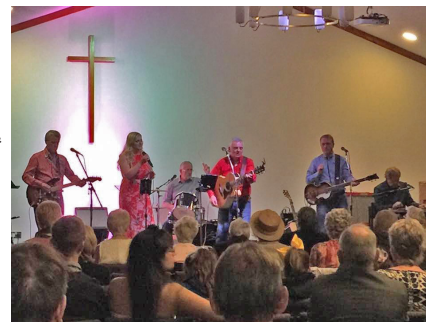
‘LIVE ISSUE’ in concert