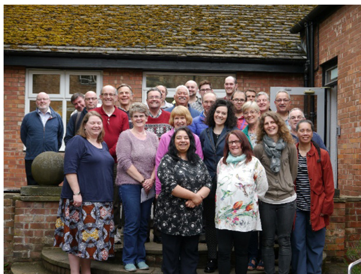
Some of the ‘Summer School’ participants