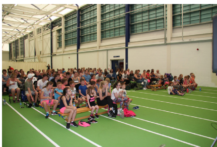
Sports Day Crowd