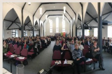
Sheffield Heeley Church – assembly crowd