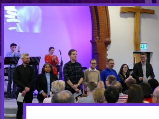
LICENCED MINISTERS – receive their District Licenses