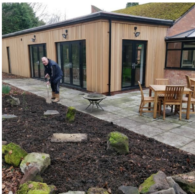
The area behind the Café Extension