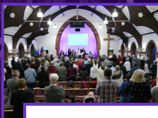
ASSEMBLY WORSHIP - at Bushey Baptist Church