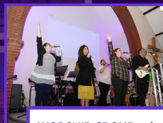
WORSHIP GROUP – the Birmingham Portuguese Church leads in worship