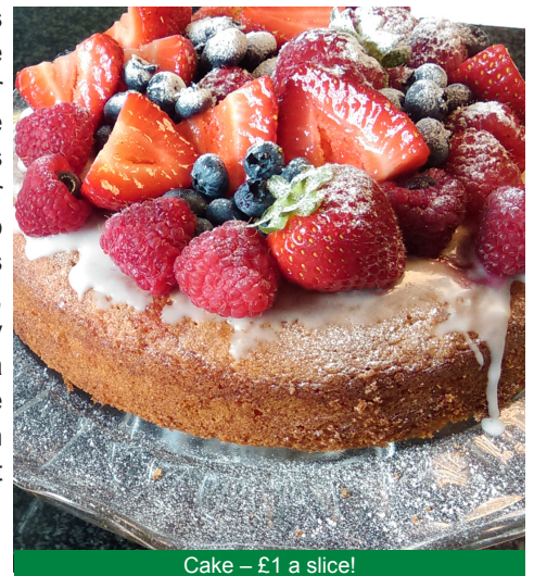
Cake – £1 a slice!