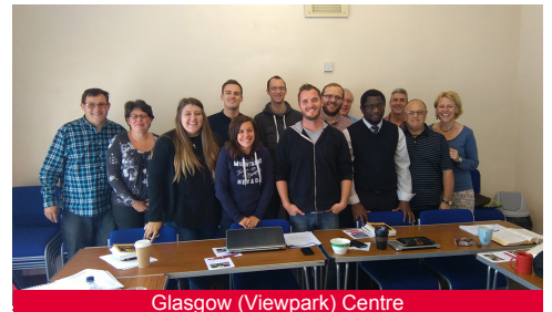
Glasgow (Viewpark) Centre