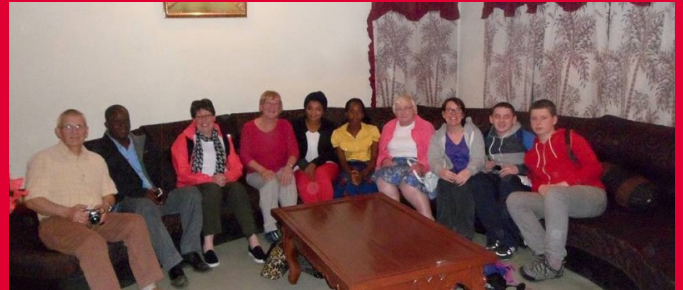
The Team Relaxing