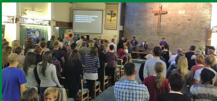
Glossop Baptism Service