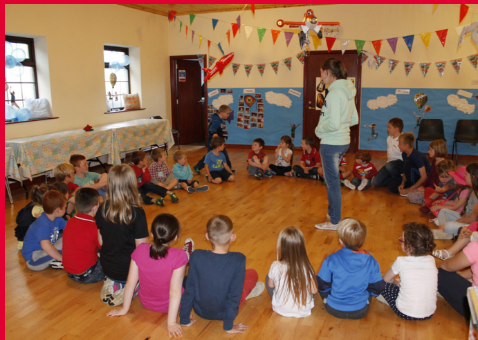
Holiday Bible Club