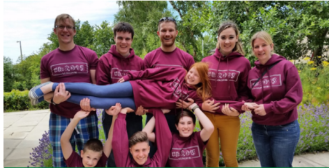
Group wearing Northbreak merchandise