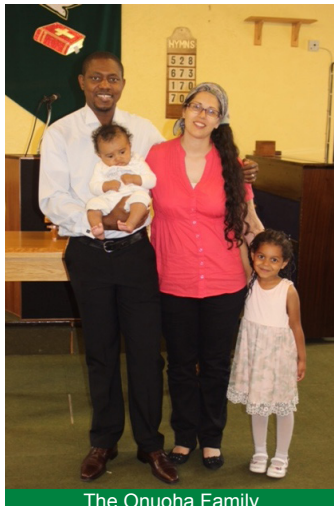
The Onuoha Family