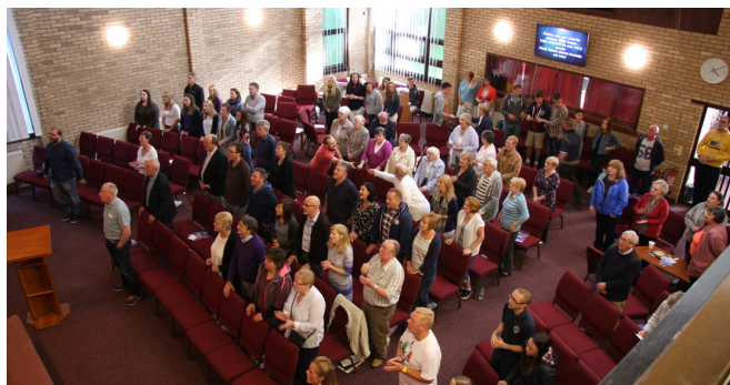
INSPIRE Worship session