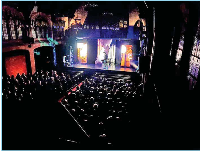
‘Luv Esther’ Musical

Perhaps the highlight of ‘Nouveau Life’ was a live production of “Luv Esther” – a West End