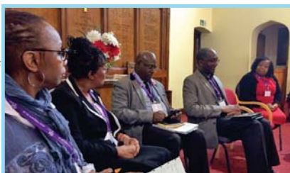
Holiness Leaders at the Wesleyan Holiness Connection