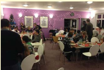
Manse Families Christmas Meal at NTC