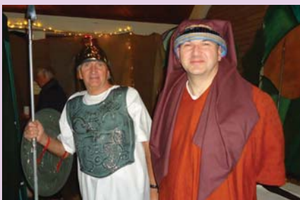
Carlisle – “The Bethlehem Experience” - for the 4th year in a row the Carlisle church has presented the sights, sounds, and smells of Bethlehem...over 200 from the local community visited the church, and 100 students from 3 local schools came to learn about the Christmas Story