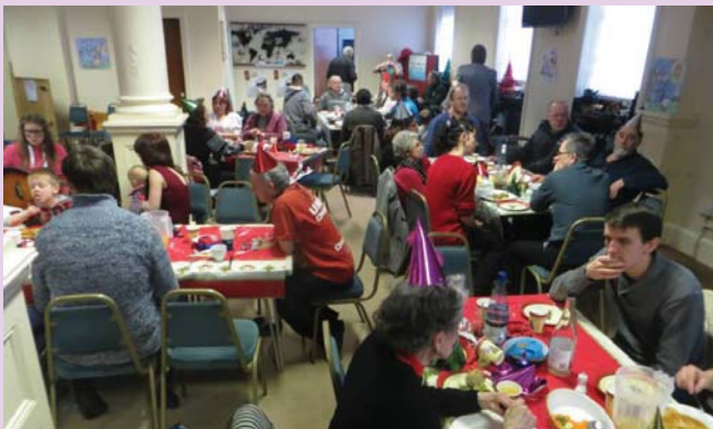
Ashton – Christmas Day meal was enjoyed by nearly 100 people...this is the 15th year the Ashton Church has provided for the community in this way.