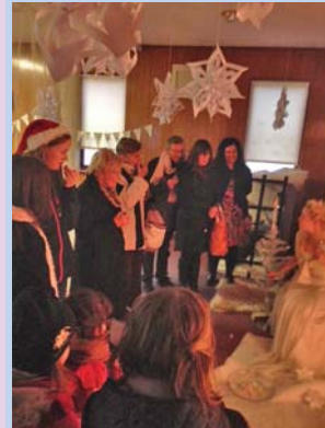
Troon – presented “The Narnia Experience” based on the C. S. Lewis story. This was part of the town’s “Wintertainment” programme and queues formed outside the church