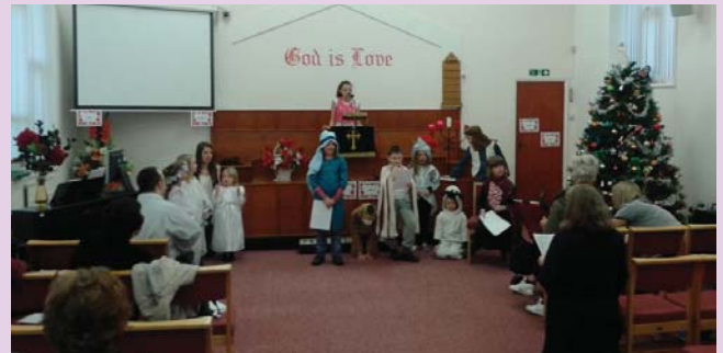
Barnsley – Family Carol Service...Christmas Services at the Barnsley church also included, Christingle Service, Carols by Candle-light and a Favourite Carols Service