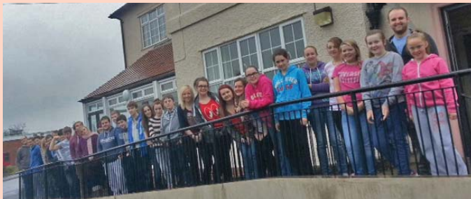
Northern Ireland Youth Weekend