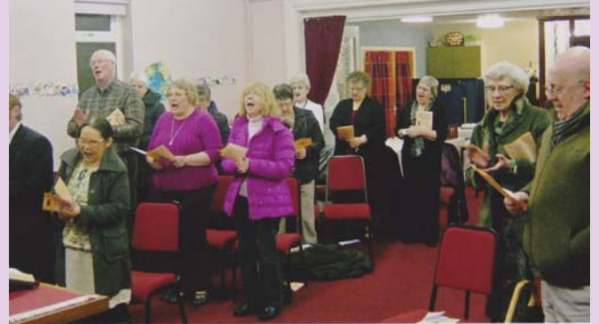
Part of the Anniversary Congregation