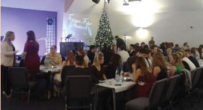
Extravaganza at Parkhead Nazarene