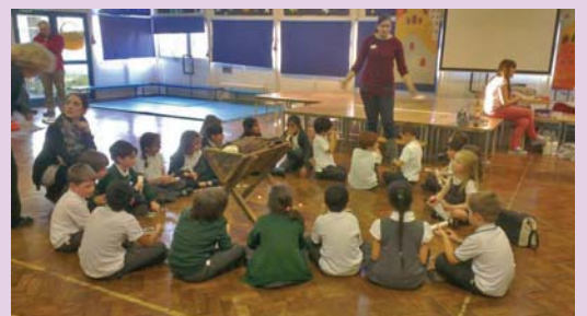
Didsbury Community Church – children seated around the Manger...a team of 8 from the church shared the Christmas story in 3 separate sessions with around 70 children and staff at Broadoak Primary School, Didsbury, Manchester