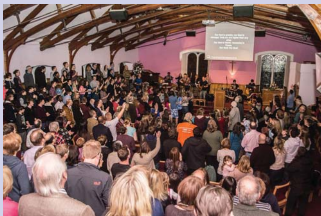
The Perth congregation worshipping