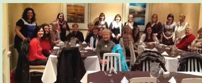
North District Manse Ladies