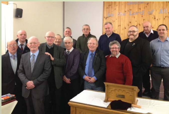
Some of the men who attended the Largs Mission