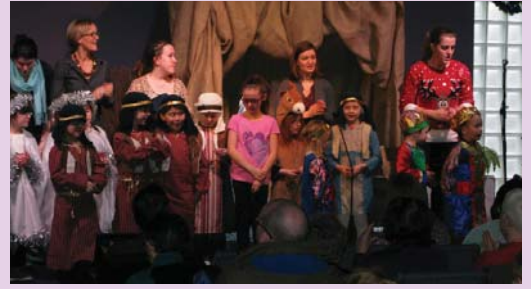
Parkhead – part of the cast for “A Wean in a Manger” presentation in the new Parkhead church