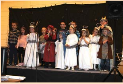
Desertmartin – children presenting “At the Manger” Christmas programme