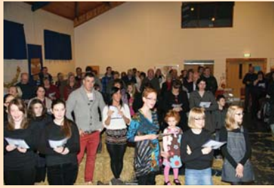
and Part of the 150-strong congregation that attended the Community Christmas Service in which all the departments of the church took part.