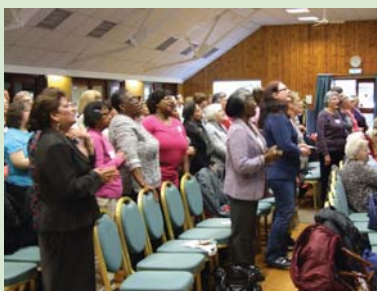
Worship & Celebration at the Ladies Retreat