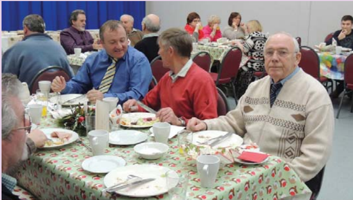
Bangor – the “Prayer & Praise” Fellowship enjoy a Christmas lunch at Bangor