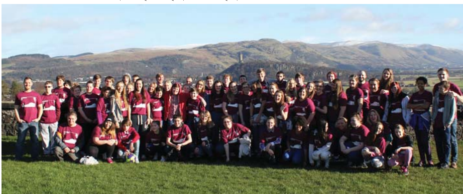
Retreat group on a beautiful bright day with the Wallace Monument in the distance