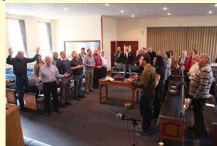
Prayer Conference Worship