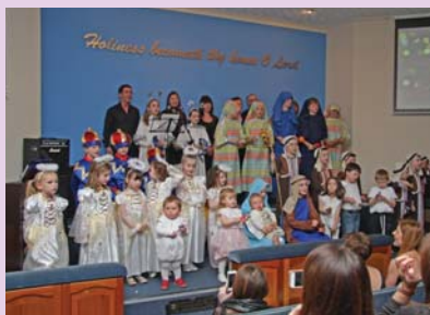
Irvine – children and young people present “A Gift for the Baby Boy” to a full church