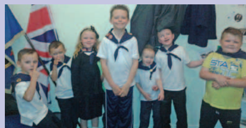
Caravanners in the Shankill church