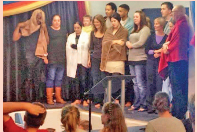
Baptism candidates (with towels) and their sponsors