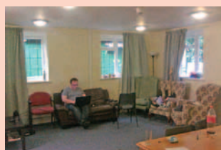
...and Common Room