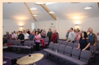
Some of those who attended the District Ministries Day

Held on Saturday 14th September in the Parkhead Nazarene church, this North District Ministries Day took as its theme, "Improving Your Serve..." It was a day of reunion, worship, learning and celebration. Seminars were held and presentations given on a variety of topics including, prayer, children's ministry, street pastors, food banks and testimonies were given. A bookstall and various exhibits made a valuable contribution to the day's activities.