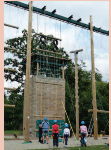
The High Ropes and Gladiator Wall...only for the brave!