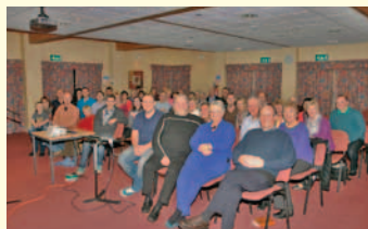
North District group at Glenada