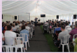
Communion Service in the marquee

CONDOVER HALL – near Shrewsbury – was a new venue for both the Northbreak & Breakthru district holidays. The magnificent mansion, supplemented by accommodation blocks, dining facilities, and outward bound course equipment, made it an ideal setting for the holiday activities and programmes. A good sized marquee, pitched on the back lawn, purchased by the Breakthru Holiday Team/ South District, created a new atmosphere for worship and fun gatherings. The Northbreak Holiday is grateful that it was able to negotiate arrangements to use the marquee too.