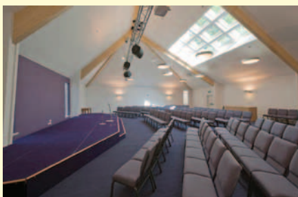
The spacious bright “Sharpe Hall”