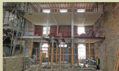
Internal work at the Battersea Rise Church