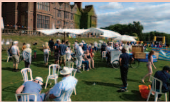
"Bygone days at the Beach" – complete with 'handkerchief hats' for men, and the ice cream cart