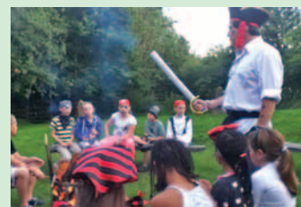
'Pirates in Training' at the South District Camp