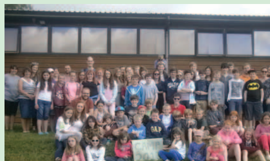
2013 campers – children, helpers and leaders

"While contemplating these wonderful and ancient stories of the 'Jesus Crew' of old, the children were put through their pirate paces...learning vital pirate skills such as archery, wall-climbing, surprise water-bomb attacks, and how to find your way through a dark and dangerous forest blindfolded (you never know when a young pirate might need such skills!). In the evenings songs were sung, marshmallows were toasted around the campfire and adventure tales were told. A great adventure was had by all. But on the last night there was the greatest celebration of all – for many of these 'young recruits' did indeed join Jesus' crew and their greatest adventure has only just begun as they follow wherever He leads! 'Yo Ho Ho and a bottle of pop!' - maybe next year you would like to join us!!"