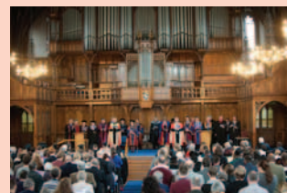
Graduation worship in the Whitworth Hall