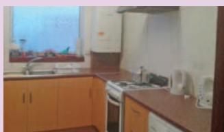
Viewpark's new kitchen