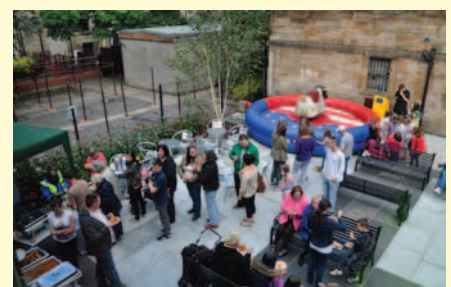
The Courtyard...folk queue for burgers with the bucking bronco at the Street Party