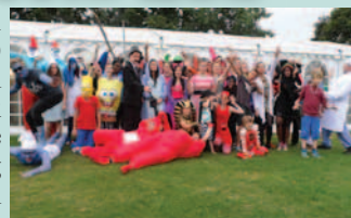
2013 Youth Camp "characters"