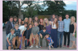
Some of the young people - from Erskine, Parkhead, & Perth