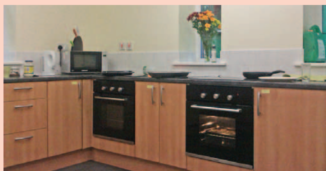
The new Hurler Hall kitchen extension...