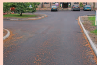
“Tarmac’d” at last