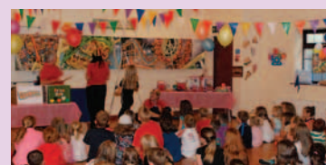
Children in 'Sonworld Adventure Park'

"On various nights we had popcorn, pic-n-mix, and other food associated with a theme park, but most importantly the children had the opportunity of hearing about Jesus through Bible stories, singing, quizzes, crafts and games. Children learnt, over the 5 nights, how to, Choose to Believe, Choose to Act, Choose to Forgive, Choose to Obey, Choose Jesus."