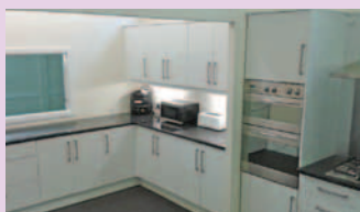
The new and extended Uddingston kitchen